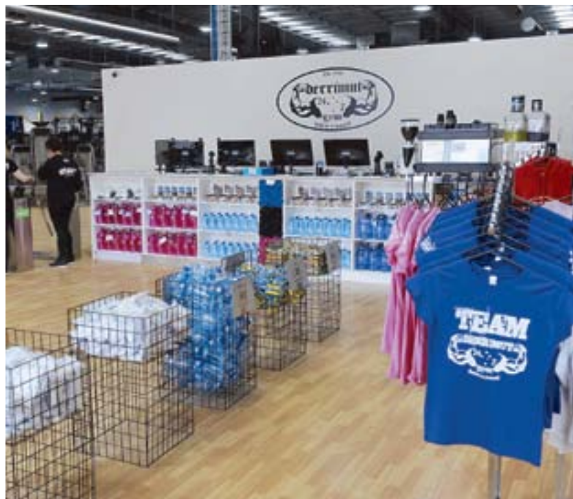
This round-the-clock gym is fully staffed and provides excellent facilities. 138674

"Our staff are fully trained in the fitness industry with most having certificate III and certificate IV in fitness. They are very enthusiastic in their